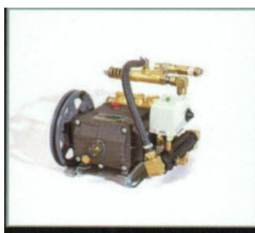
Manifold Plumbing Assembly: The plumbing assembly utilizes quick couple connections allowing for easier and quicker service of the pump module.