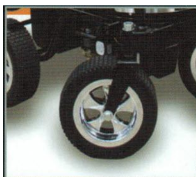
Flat-Free Swivel Wheel: 360° swivel flat-free mag style tire and wheel assemblies for the best mobility available.