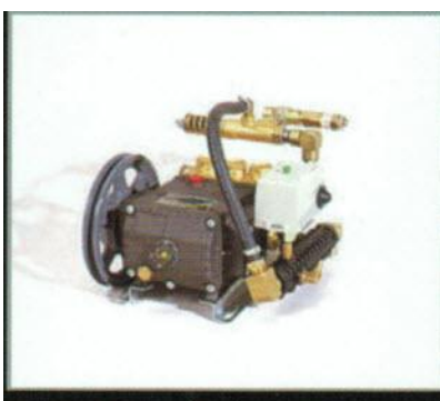
Manifold Plumbing Assembly: The plumbing assembly utilizes quick couple connections allowing for easier and quicker service of the pump module.